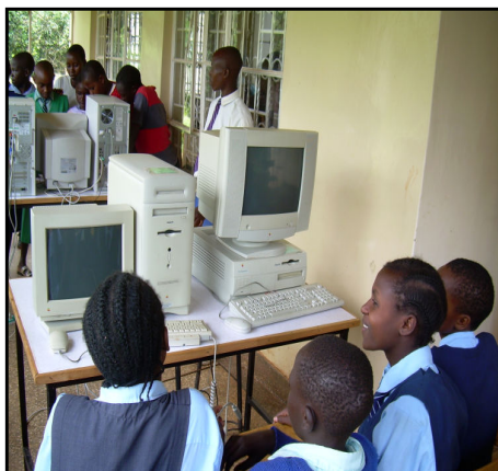
Jitegemee students learning to use computers.

Jitegemee is also making great strides in the vocational training program. We have recruited a new class