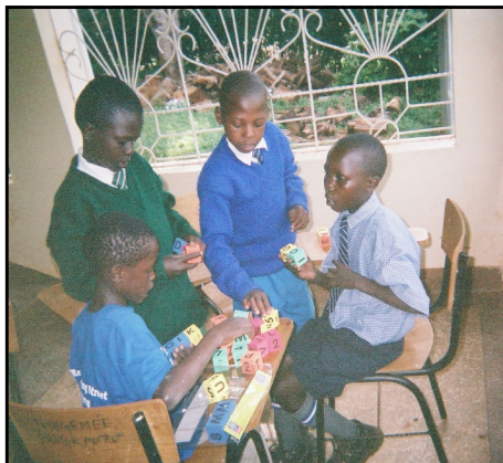
Jitegemee students playing with blocks during school vacation.

third-year high school student, said her internship at the district office of the Ministry of Information changed her view of her own future. "I did not know I